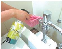
Toilet flush levers

* Use a second cloth to clean visible streaks left behind after wiping down.